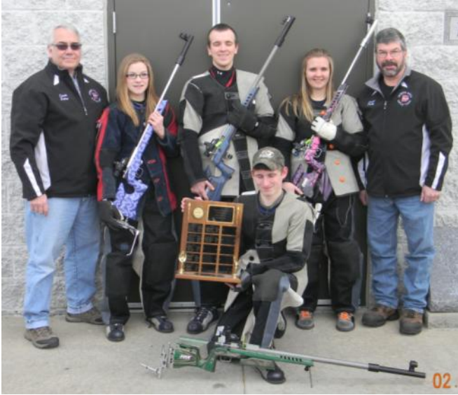
DuBois Area High School first place