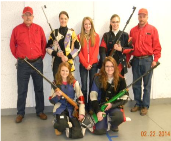
Conemaugh Twp. 3 rd place